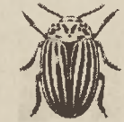
Colorado Potato Beetle