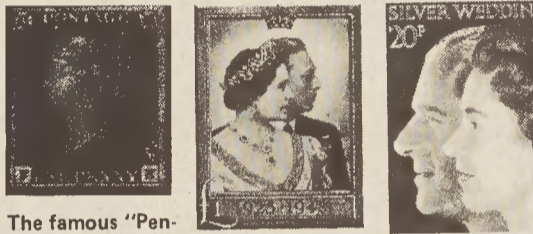
The famous "Penny Black," the world's first stamp, was issued in 1840, the same year Queen Victoria married Prince Albert.