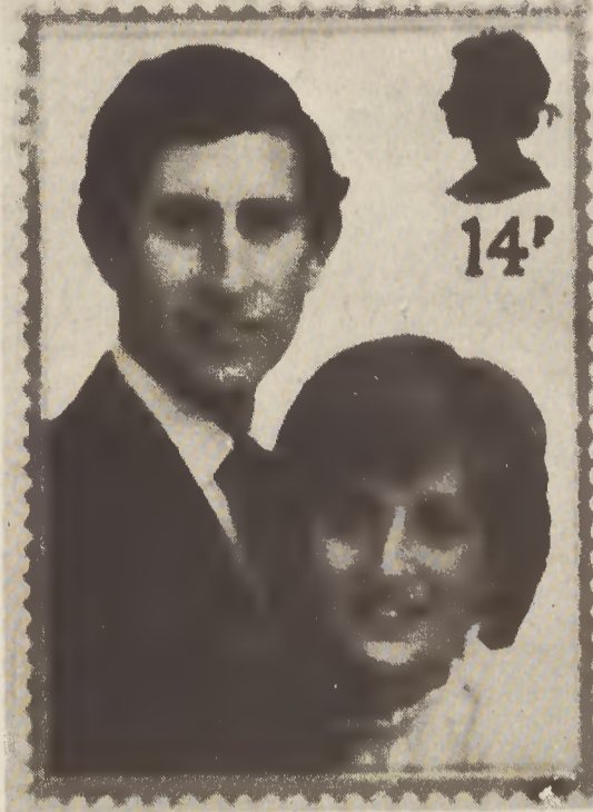
A free copy of the official postcard of a special Royal Wedding stamp being issued by the British Post Office to mark the historic marriage of Prince Charles to Lady Diana Spencer, is now available in North America.

As a token of goodwill, a limited quantity of the official postcards of the Royal Wedding stamp shown above is now available at no charge in North America from the U.S. representatives of the British Post Office. A special limited-edition souvenir album, containing the British stamps for Prince Charles and Lady Diana as well as a colorful photographic history of previous