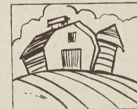
One recent estimate is that there are 2,314,013 farms in the United States.

You can't break your wrists then, and the finger also serves as a fine guide in making the stroke. This is especially helpful in improving the putting of senior golfers. It's also to be recommended to golfers of all ages who are erratic on the green.