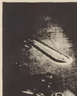
This 40 watt fluorescent U-line tube has gone from the factory into our homes.

Main St. Phone 434-7898 Boiling Springs, N. C.