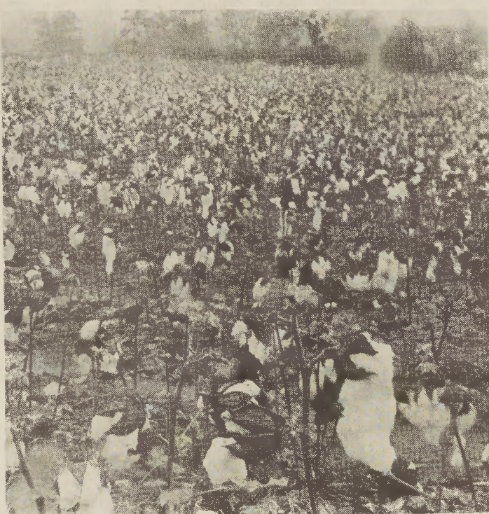
Cheated of even a drop of rain during the summer heat, Cleveland's cotton fields have been treated to deluges this week. "It didn't need it," a farmer says wryly. "But if it doesn't stay wet too long it won't hurt it much."