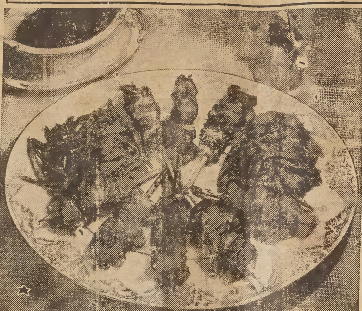
"City chicken" centering the table, accompanied by a tangy sauce and buttered green beans, is sure to bring favorable comment from your summer diners. These veal cubes, threaded on wooden skewers, are braised—dredged in seasoned flour and browned, then cooked with a little liquid in a covered frying-pan.