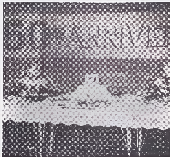
A view of 50th Anniversary Birthday Cake at time of reception on Friday night at convention.

No doubt the most inspiring part of the morning session was the youth program, during which an