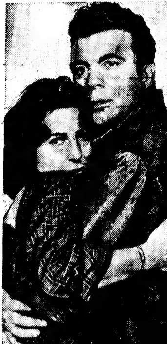
Fast-rising Anthony Franciosa stars opposite Oscar-winners Anna Magnani and Anthony Quinn in Hal Wallis-Paramount's "Wild Is the Wind," due Sunday at the Masonic Theatre.

Another thing to look for in studying the seed varieties is the height to which they will grow. Tall-growing crops should be planted together and low-growing ones together (preferably to the south of the taller ones) to avoid shading the lower plants. Vegetables need about eight hours of full sunlight to produce well.