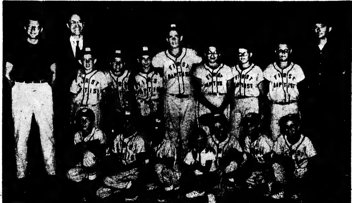
CHAMPS —Winning 11 games and tying one was good enough to give the First Baptist Church team top honors in New Bern's fast Sunday School league.