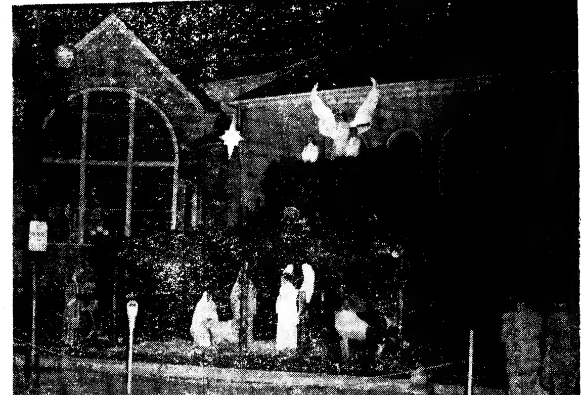
AWAY IN A MANGER—All the beauty that unfolded one Holy Night, in a little town called Bethlehem, is portrayed by the Living Nativity presented each year by Cen-