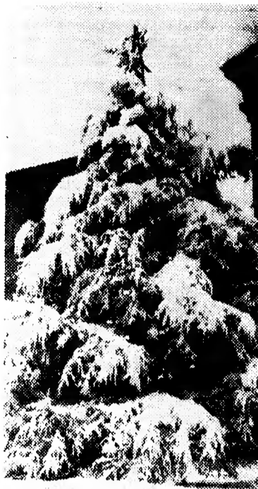
TRANSFORMED — Not content with the colored lights adorning the Christmas tree on the lawn of our county courthouse, Dame Nature covered them with her own decoration. Only the star at the top of the tree escaped concealment.

We hear and use this word "kindness" so often that we lose sight of its true meaning. It is too often thought of just as politeness and good manners, whereas the kindness of a Christian is an