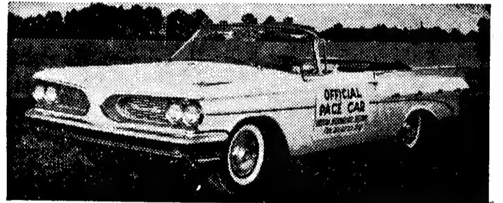
*1959 Pontiac Bonneville

Ask about the $1000 Wardrobe Bonus Award!