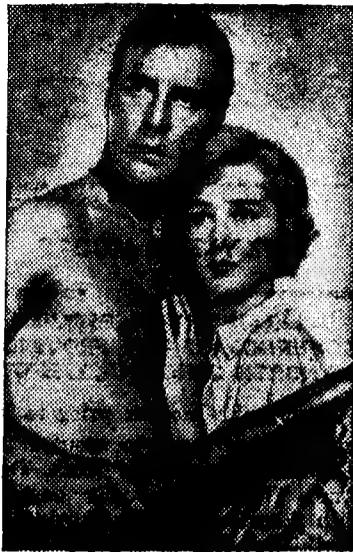
George Montgomery and Taina Elg have the romantic leads in "Watusi," M G M's thrill-packed new adventure of the African jungles.