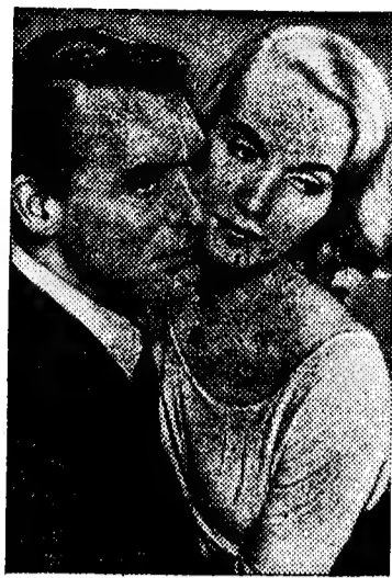
Cary Grant falls in love with a girl of mystery, Eva Marie Saint, in "North By Northwest," new MGM thriller produced and directed by Alfred Hitchcock. James Mason also stars in a spine-tingling drama mixing romance, suspense and espionage.