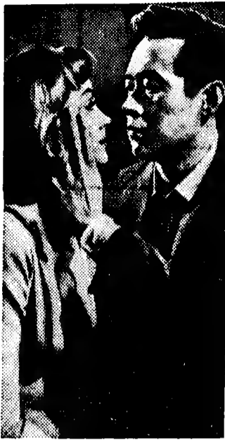
Victoria Shaw and James Shigeta star in Columbia Pictures' "The Crimson Kimono," a turbulent love story of jealousy and violence. Glenn Corbett also stars.

In regard to the rushing Christmas season, one of the newspapers over here said that it could tell for sure that Christmas was coming—postal workers in Sydney were threatening to strike, beer (the Australian national drink) was going up by a penny a glass, and an announcement was made that hams were very scarce this year and would be fairly expensive. The paper went on to say that these were all sure signs of approaching Christmas and they happen every year.