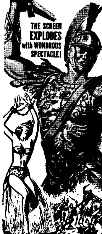
Starring Anita Ekberg and George Marshall