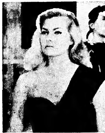
Swedish beauty, Anita Ekberg, as she appears before the Roman Court for her barbaric destructions, in American International's "Sign of the Gladiator," in Color-Scope, which opens Sunday at the Masonic theatre.