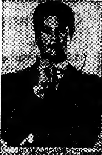
Tony Curtis stars as true-life hoaxter Ferdinand Demara in Universal-International's fascinating "The Great Imposter."

away, So do I ever, wandering where I may, Sing O my home! Sing O my home! Of thee. —Eugene Field.