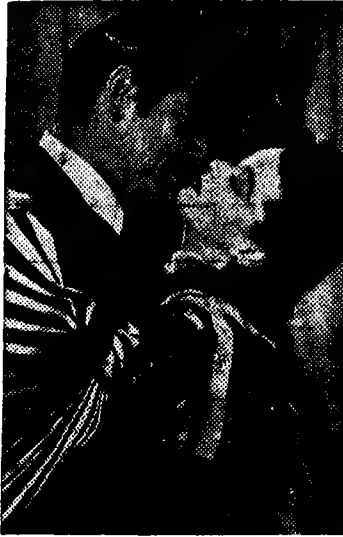
Clark Gable, in his memorable role of Rhett Butler, and Vivien Leigh as Scarlett O'Hara in David O. Selznick's production of "Gone with the Wind." One of the great motion pictures of all time, the screen version of Margaret Mitchell's famous novel is presented by Metro-Goldwyn-Mayer in tribute to the Year of the Civil War Centennial.

is not working and the sub-conscious is working, it steers the functions of the body. Usually the conscious mind is in a state of suspension which could be caused by many reasons. Then it seems the patient is merely sick and science can help the conscious mind to again function, restoring the person to normalcy.