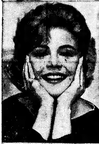
Pretty Sandra Dee, America's most glamorous teen-age blonde star, headlines with Rock Hudson, Gina Lollobrigida, Bobby Darin and Walter Slezak in "Come September," romantic comedy in Technicolor. The 7 Pictures Corporation-Raoul Walsh Enterprises, Inc., production is released by Universal-International.