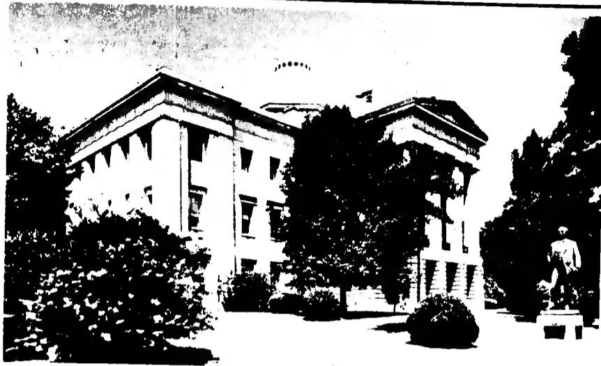
The Capitol of North Carolina, a beautiful building dating from 1833, flew the Confederate flag from 1861 until 1865 and continues to do so today—on May 10, Confederate Memorial Day. The secession ordinance was adopted here on May 20, 1861, and was celebrated by firing 100 guns on Capital Square. Later saltpetre for manufacture of gunpowder was stored in the rotunda. General Sherman occupied this Capitol on April 14, 1865, on his march from Bentonville, the bloodiest battle fought in the State, to the Bennett House near Durham. There he received General Joseph E. Johnston's surrender of the last major field army of the Confederacy on April 26, 1865—17 days after Lee's surrender at Appomatox. The Capitol is open to visitors, and has an information desk in operation during State office hours.