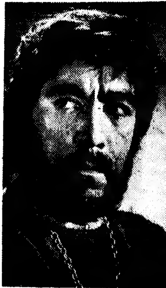
Anthony Quinn as he appears in the title role of "Barabbas," Dino De Laurentiis' Technicolor-Technirama production for Columbia Pictures release. Also starred are Silvana Mangano, Arthur Kennedy, Katy Jurado, Harry Andrews, Vittorio Gassman, Jack Palance and Ernest Borgnine.

Time flies over us, but leaves its shadow behind.--Nathaniel Hawthorne