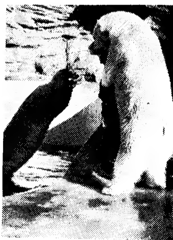
BEARPLAY . . . "Frank," cautious polar bear at Denver, Colo., zoo, watches his mate, "Sophia," dive into the pool. After she reported the water was cold enough, Frank joined her.

And once, my sweetheart came. She did not--nay, of course she could not--know,