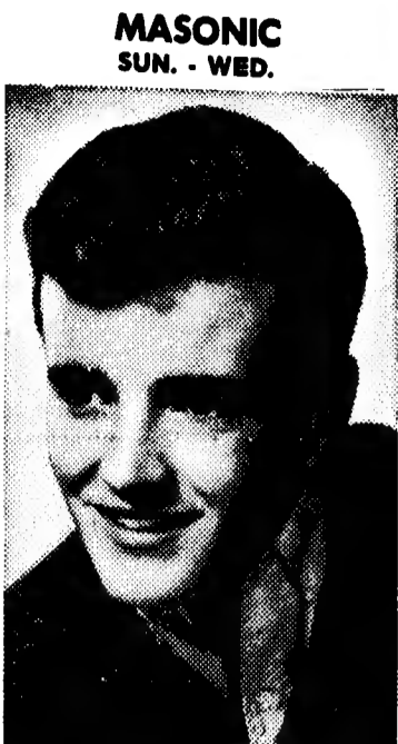
Robert Walker, son of Jennifer Jones and the late popular film star, Robert Walker, Sr., who bears a striking resemblance to his father, makes his motion picture debut with Kirk Douglas and Nick Adams in Metro-Goldwyn-Mayer's powerful war drama, "The Hook." Young Walker portrays an idealistic young GI in the film, produced by William Perlberg and directed by George Seaton. It was Perlberg and Seaton who also brought Bob's mother to the screen in "Song of Bernadette," for which she won an Academy Award.

and Canada under the joint sponsorship of Swissair and the Hilton Hotels. There are two teams, each consisting of a chef de cuisine, two stewards and four hostesses.