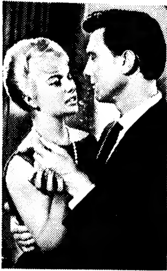
TENSION MOUNTS as Martha Hyer digs her fingernails into the hand of Laurence Harvey in a scene from Hal Wallis' Technicolor drama, "A Girl Named Tamiko," opening Sunday at the Masonic Theatre.

As I moved throughout the many rows of projects, awe stricken, many thrilling thoughts ran through my mind. The countless man hours involved must have been tremendous; the guided thought, the intricate artwork in minute detail; the talent, the imagination,