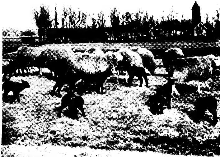
BLACK SHEEP IN THE FAMILY . . . A flock of black sheep mysteriously appeared on a Netherlands farm recently, born to all white sheep mothers and presumed white sheep fathers.

Emerson said; "We are bigert or surrounded by