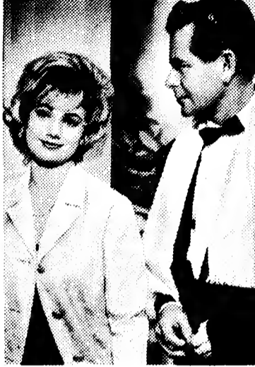
Shirley Jones and Glenn Ford comprise the delightful new romantic team in Metro-Goldwyn-Mayer's "The Courtship of Eddie's Father." Miss Jones plays the girl across the hall who has hopes of moving into Ford's apartment as his wife. Also starred in the comedy-drama are Stella Stevens, Dina Merrill, Roberta Sherwood, young Ronny Howard and Jerry Van Dyke.

ability as the team's leader is legendary. He had one of the finest arms in baseball history, and very few runners ever attempted to steal second when he was behind the plate.