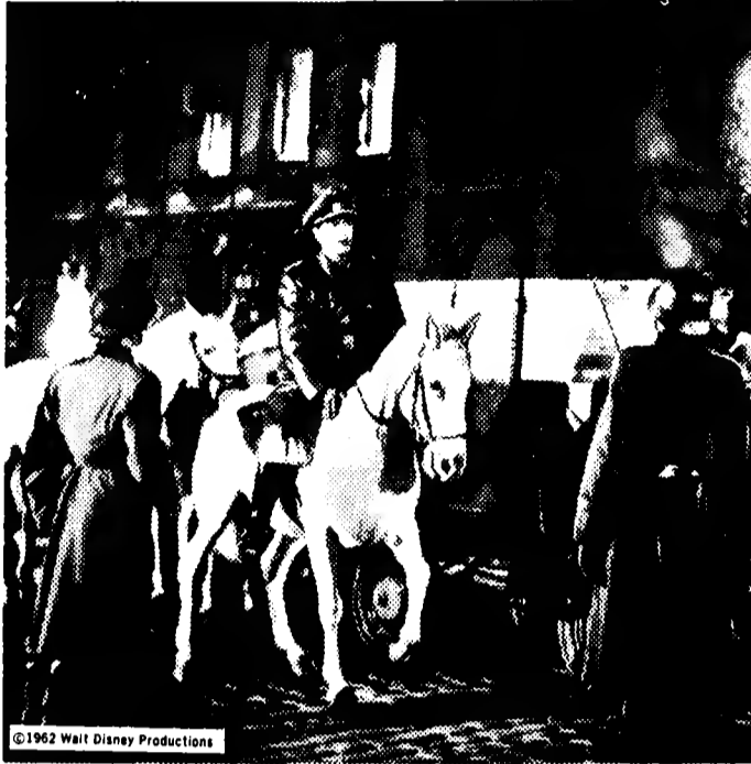
DECEPTION—Robert Taylor talks his way through a road-block in an effort to rescue a herd of valuable horses in Walt Disney's Technicolor feature, MIRACLE OF THE WHITE STALLIONS. Buena Vista releases.

bined--cancer, congenital malformations, and pneumonia. Unless there is a significant change this year, 17,000,000 American children between the ages of one and 21 will be injured, maimed, or killed in accidents in 1963.