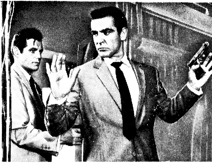
Ian Fleming's famous Secret Agent 007 of fiction, known to millions as James Bond, comes to the screen for the first time in the person of Sean Connery in "Dr. No," United Artists' Technicolor release opening Thursday at the Tryon Theatre.