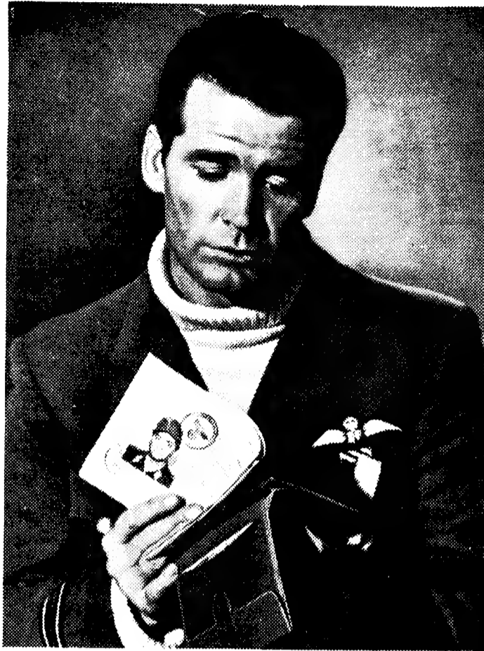
James Garner shares top stellar honors with Steve McQueen and Richard Attenborough in Mirisch-Alpha-UA's dramatization of the great Paul Brickhill true war story "The Great Escape," in Color and Panavision, opening Friday at the Tryon Theatre.

A hundred years from now, dear heart, We shall not mind the pain; The throbbing crimson tide of life Will not have left a stain, The song we sing together, dear,