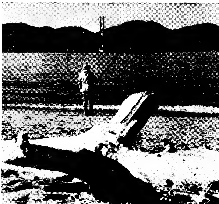
SILHOUETTES . . . A fisherman, facing the rolling hills of Sausalito and the Golden Gate Bridge which connects them to San Francisco, waits for a bite on his line.