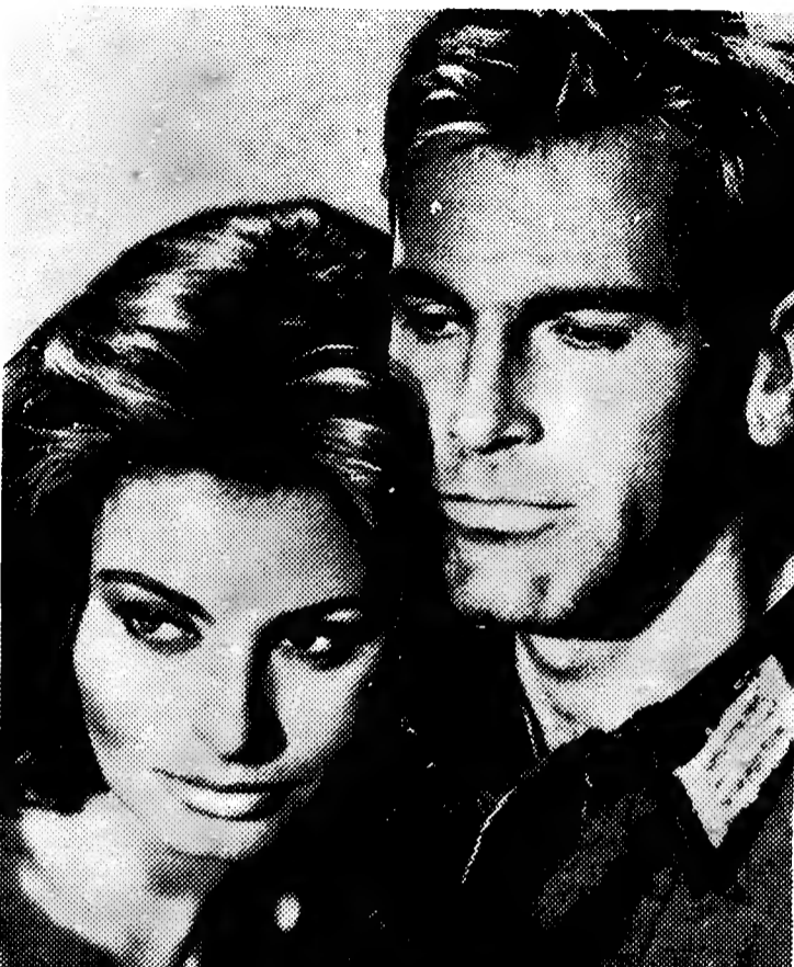
Oscar-winners Sophia Loren and Maximilian Schell team in the dramatic "The Condemned of Altona," Carlo Pont-Titanus production directed by Vittorio De Sica. Filmed in Germany, the 20th Century-Fox release opens Sunday at the Tryon Theatre.