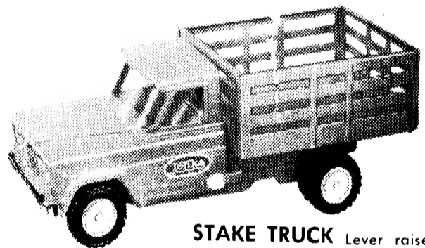
STAKE TRUCK Lever raises back for unloading. Haul blocks,