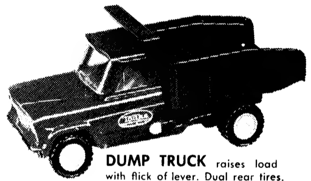
DUMP TRUCK raises load with flick of lever. Dual rear tires.

Mini-Tonka trucks that are authentic down to the last detail - yet little more than ten inches long! Jumbo heavy duty tires, bright paint job that stands up to the most realistic collisions ever. From pick up to camp out, there's a play truck for every need.