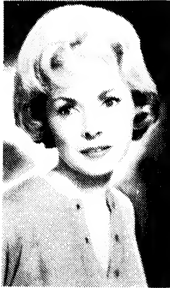
JANET LEIGH plays Bertie, the wife of a successful writer in the new Hal Wallis comedy, "Wives and Lovers" which opens Sunday at the Masonic Theatre.

Lovers, forget your love, And list to the love of these, She a window flower,