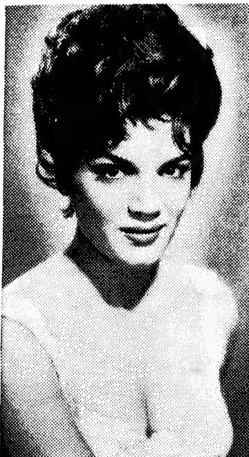
Popular songstress Connie Francis heads the cast of Metro-Goldwyn-Mayer's "Follow the Boys," in which she plays a bride who follows her Navy husband to the French Riviera. Connie sings four songs in the new romantic comedy, filmed in Panavision and co-starring Paula Prentiss, Dany Robin, Russ Tamblyn, Richard Long, Ron Randell, Roger Perry and Janis Paige.