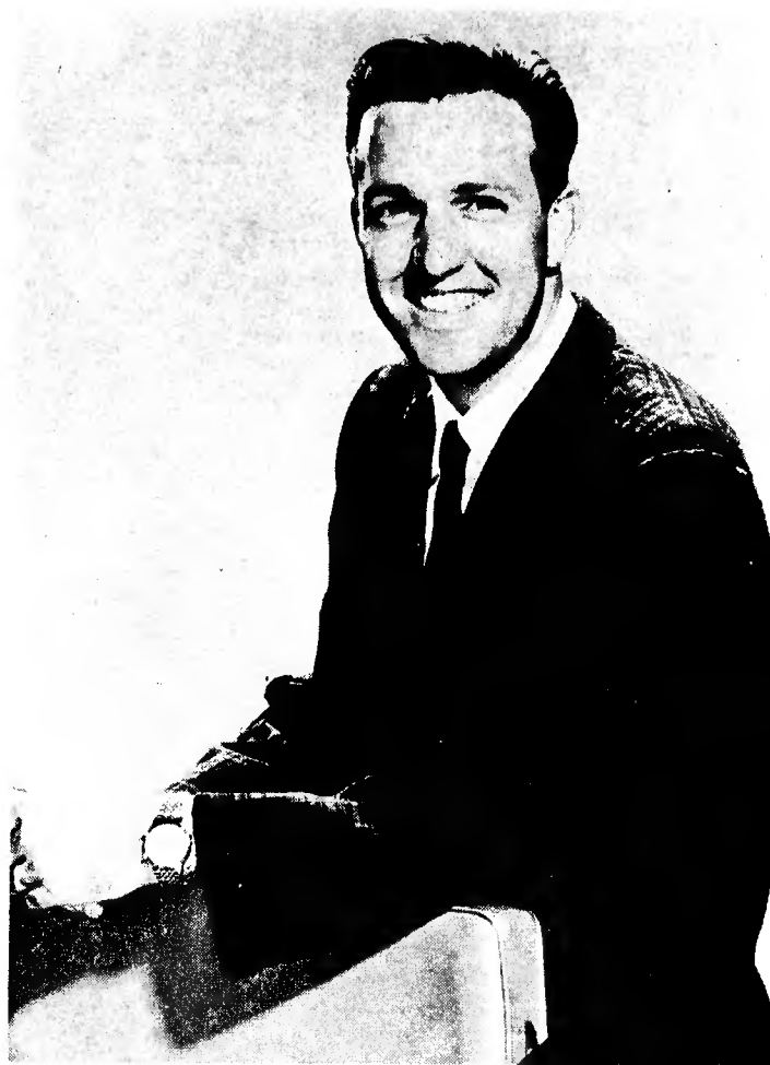
A FAVORITE—Host of "Hootenanny"—televised Saturday nights on WNBE — Jack Linkletter is as popular with New Bern teenagers as he is with America's college crowd.

Until next week, Happy New Year again, and take care.