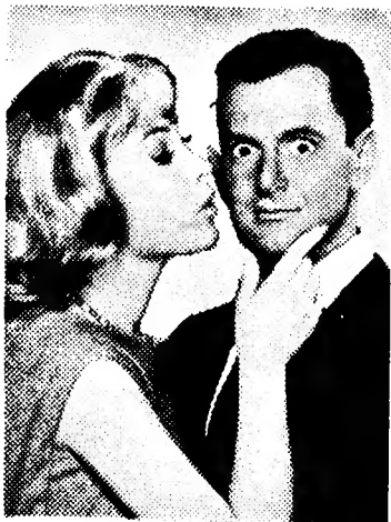
Barbara Eden is the fiancée of Tony Randall until the latter opens "The Brass Bottle" which releases an Arabian Night genie, Burl Ives, in the Universal picture in color.