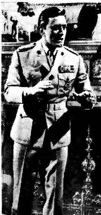
KIRK DOUGLAS portrays Marine Corps Colonel 'Jiggs' Casey in Paramount's new suspense drama, "Seven Days in May," now at the Masonic Theatre. Douglas, as Casey, discovers a military plot to overthrow the government and is helpless to do anything about it until he can convince the President of its validity.