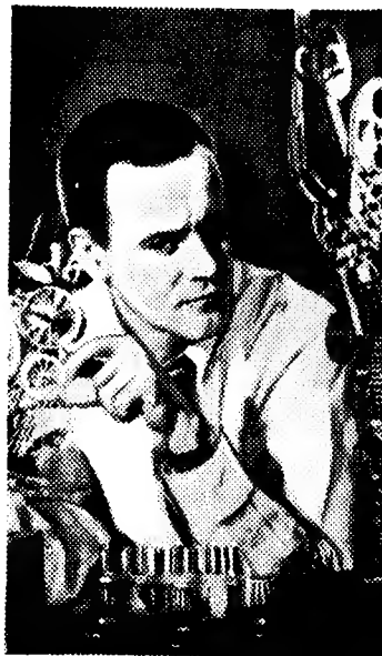
When he isn't posing as husband of the girl next door, in "Good Neighbor Sam," Jack Lemmon devotes his time to making a "junk-mobile," of which the best that can be said for it is: "It works!" Romy Schneider and Dorothy Provine co-star with Lemmon in the new David Swift production, a Columbia Pictures release in color.

way he should go, travel that way yourself once in awhile."--Josh Billings.