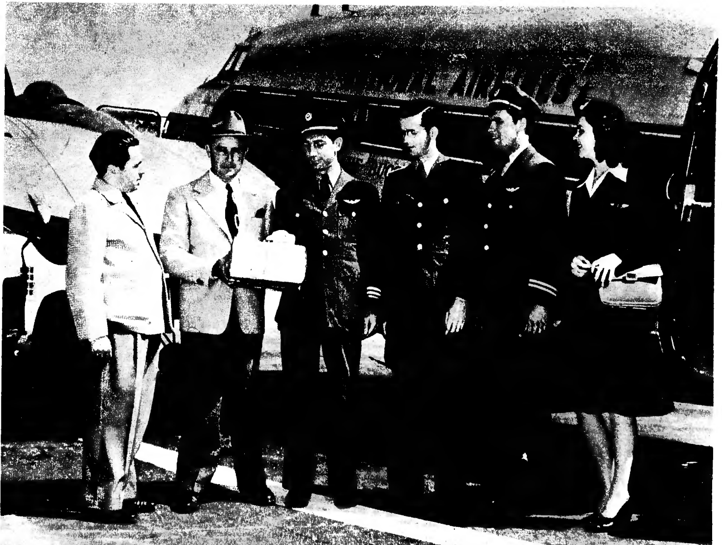
ALSO VALUABLE —Like the much larger box in the photo above, this one contained something of importance. Inside were a dozen baseballs autographed by Babe Ruth and flown to New Bern. One look at the Mirror's editor, then Coastal Plain League statistician,

lock, Marshallburg, Morehead City, Newport, Oriental, Trenton, Vanceboro, and Pollocksville will be able to dial their own station-to-station long distance calls. How's that for keeping up with the times?