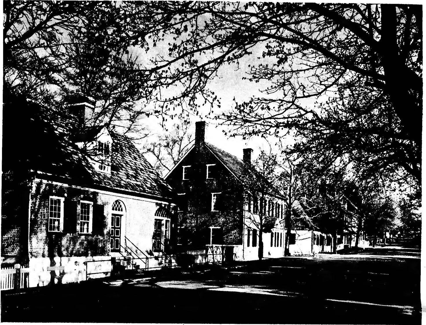
LIGHT AND SHADOWS —This is the way we saw a street in Old Salem on a recent morning. New Bernians who are interested in preserving our own town's historic landmarks can do worse than catch the vi-

This then, is the greatest power on the side of the God loving nations of a Free World.