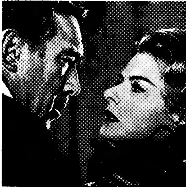
LOVERS NO MORE —Anthony Quinn and Ingrid Bergman play ex-lovers now filled with hatred for each other in "The Visit," 20th Century-Fox suspense drama in CinemaScope opening Sunday at the Tryon Theatre.

Produced by IRINA DEMICK and PAOLO STOPPA Directed by JULIEN DERODE & ANTHONY QUINN Screenplay by BERNHARD WICKI/BEN BARZMAN