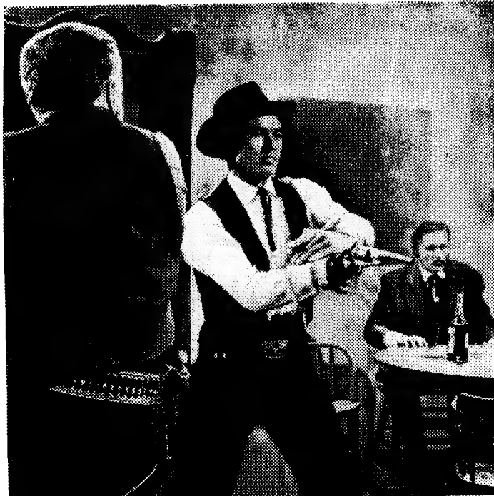
Yul Brynner in the title role of Stanley Kramer's DeLuxe Color production "Invitation To A Gunfighter," now at the Tryon Theatre under United Artists release. He shares romantic interest with Janice Rule.