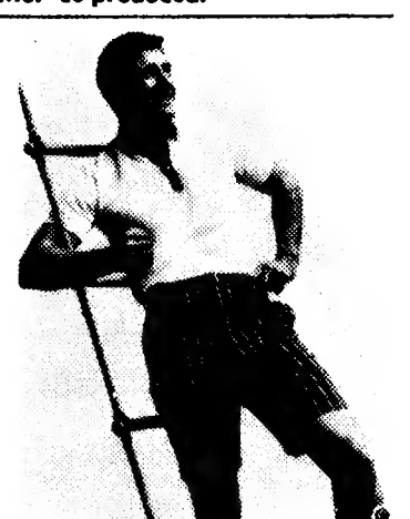
NAUTICAL—Bold white stripes and breezy styling are major trends in men's wear for summer. Here striped cotton bermuda shorts are teamed with a coordinated cotton knit shirt.

It is practically a law in life that when one door closes to us, another opens. The trouble is that we often look with so much regret and longing upon the closed door that we do not see the one which has opended to us. -- Anon.