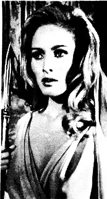
Ursula Andress in her role as Ayesha, beautiful Queen of an African kingdom, in "SHE," screen version of the world-famous adventure novel by H. Rider Haggard. The unusual motion picture combines romance, spectacle and fantasy.

neighbors for all their amusement.--Bancroft.