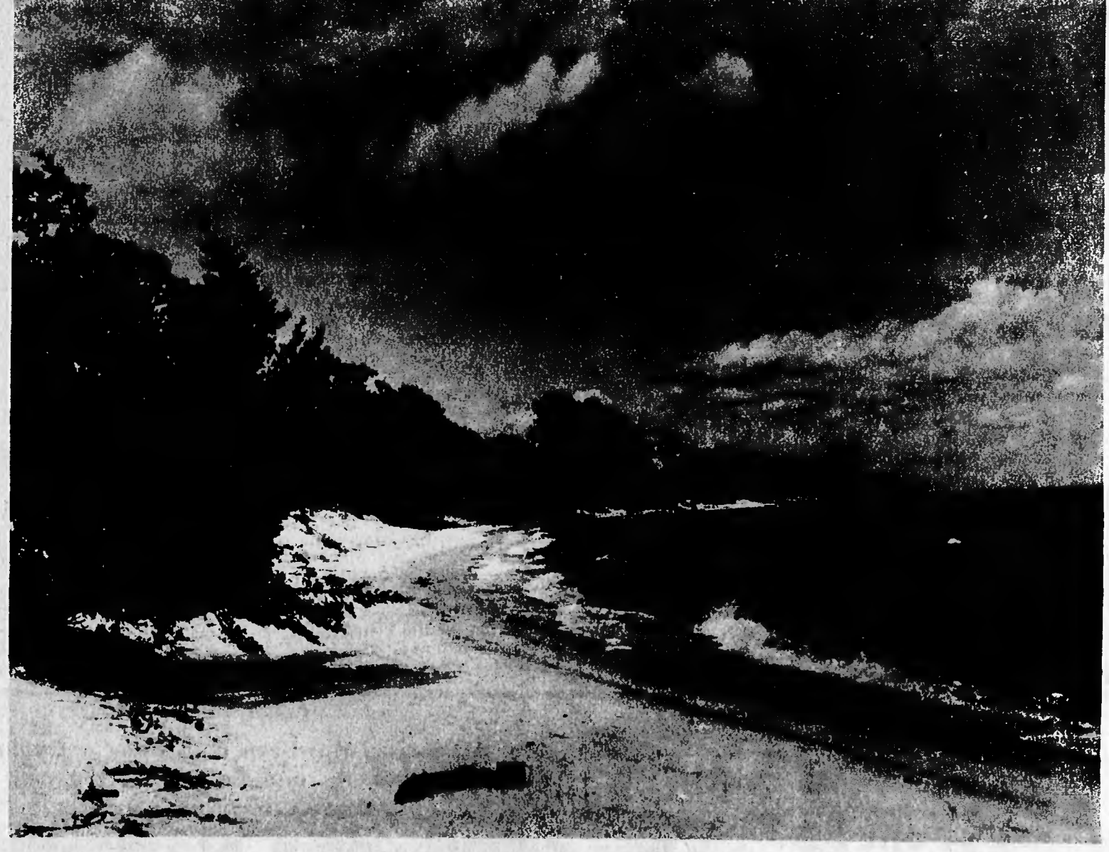
THE BEAUTY THAT ABOUNDS IN CAROLINA'S COAST COUNTRY KNOWS NO SEASON.