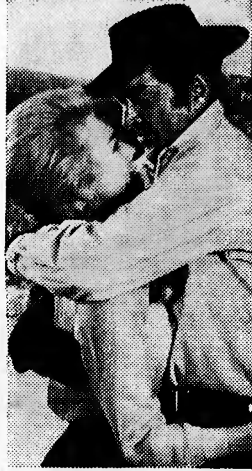
EVER KISS YOUR BARBER, Dean Martin does in this scene from "5 CARD STUD." Of course his barber turns out to be Inger Stevens. A Paramount Picture in Technicolor it opens Friday at the Masonic theatre.