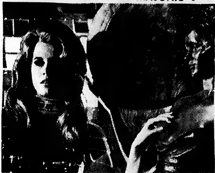
BEAUTIFUL "BARBARELLA" (Jane Fonda) pauses for a rest before leaping into her space adventure which brings on a host of characters and troubles. A Paramount Picture, "BARBARELLA" also stars John Phillip Law and David Hemmings. In color and Panavision at the Masonic Theatre.