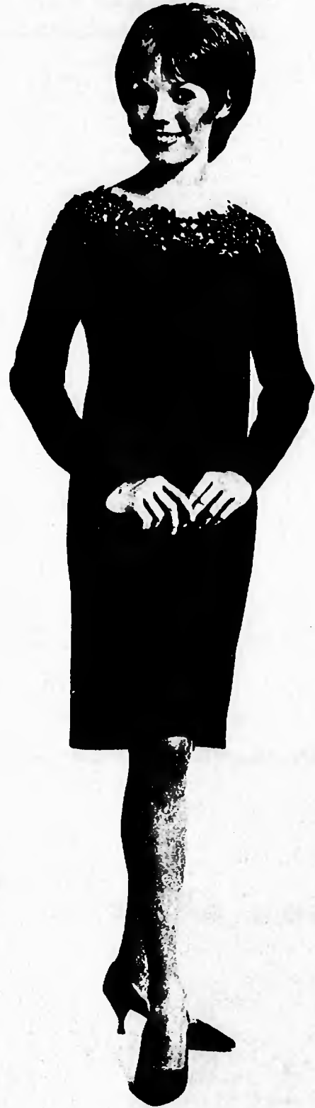
#12—Style 3032—Bonded Chiara crepe with dyed to match rhinestoned Venise lace. Colors: Black, Hot Pink, Lime Green.