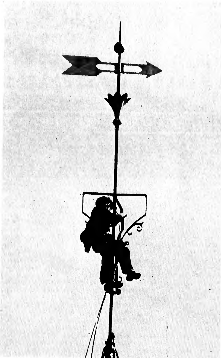
LOFTY PERCH — You may have been among those who craned their necks several years ago, to watch this elderly steeplejack working on the spire of New Bern's Christ Episcopal Church.

Eden Street, now just outside the wall of the Tryon Palace