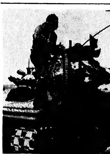
FEEDING TIME . . . Tankers load .50 caliber machinegun ammo during practice firing from a Sheridan armored reconnaissance/airborne assult vehicle during a training exercise at Baumholder, Federal Republic of Germany.

constantly; cook 1 minute. Add turkey, cooked vegetables, mushrooms and pimiento. Heat thoroughly and serve on rice, toast or biscuits.