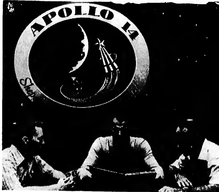
ASTRONAUTS . . . The crew of the successful Apollo 14 mission, with the mission insignia in the background. Left to right, Stuart A. Roosa, command module pilot; Alan B. Shepard, Jr., mission commander; and Edgar D. Mitchell, lunar module pilot.

The President was most complimentary to the Boerma family on their outstanding