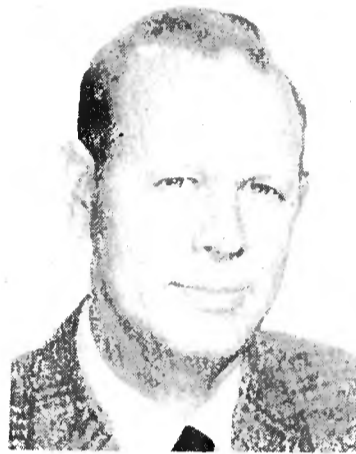
CHARLES H. KIMBRELL Candidate for Mayor

PRODUCTS FOR YOUR CAR, TRUCK, HOME & FARM